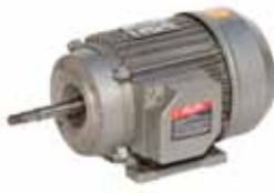
with custom made shaft