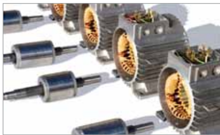
Windings and shafts