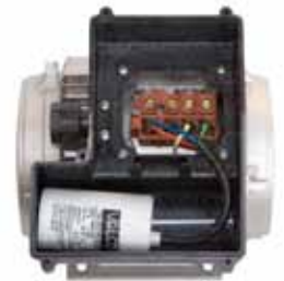
Motor with fitted the innovative, practicable and safe faston type-connection on the terminal box