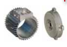
Motor Housings and Shields in Aluminium Diecast also made to Custom Designs