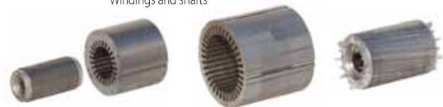
Stator laminations in iron steel sheets or magnetic silicon sheets (packs) with rotor diecast